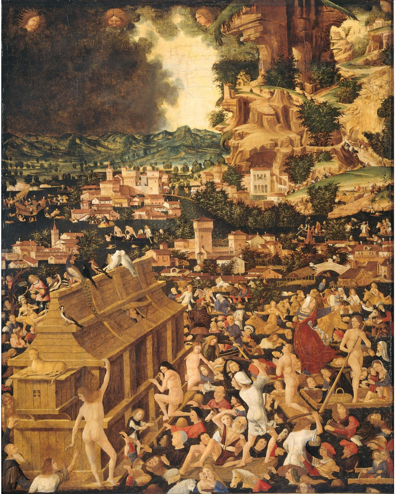
The Great Flood , by anonymous painter, The vom Rath bequest , Rijksmuseum